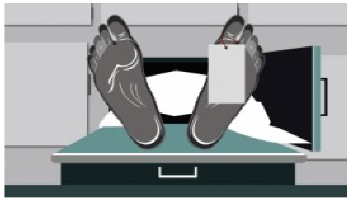
3 of a family found dead in Rangpur

Zakat for life: A mission to save lives of children with thalassemia